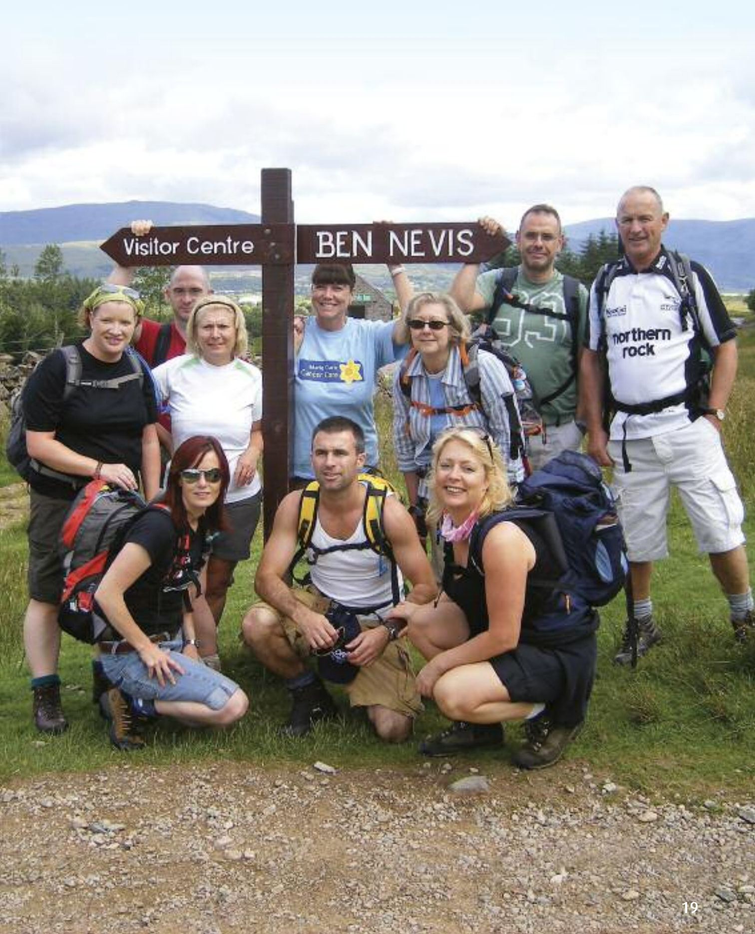
Northern Rock employees at the start of the climb to the summit of Ben Nevis, raising funds for Marie Curie Cancer Care.