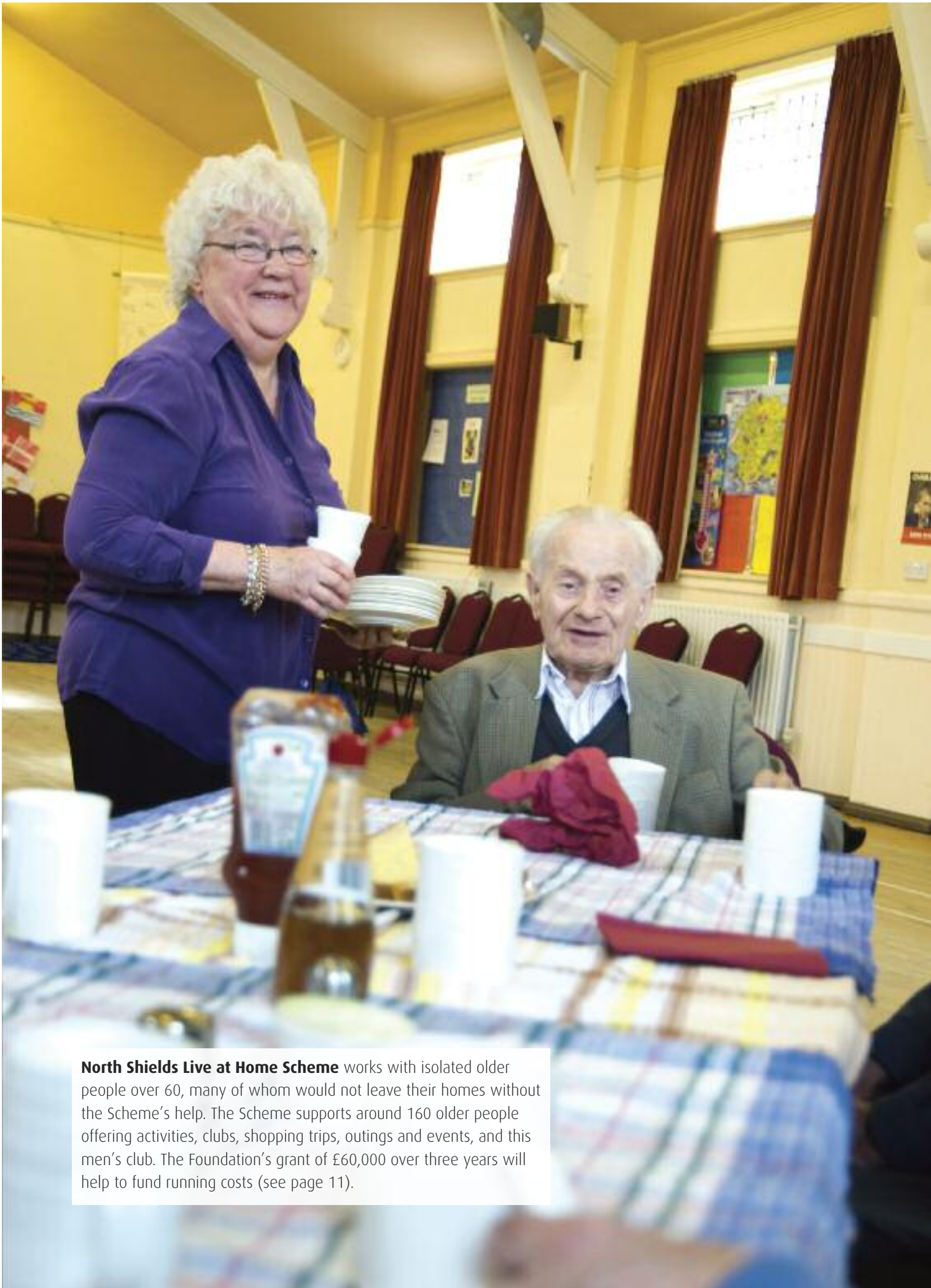
North Shields Live at Home Scheme works with isolated older people over 60, many of whom would not leave their homes without the Scheme's help. The Scheme supports around 160 older people offering activities, clubs, shopping trips, outings and events, and this men's club. The Foundation's grant of £60,000 over three years will help to fund running costs (see page 11).