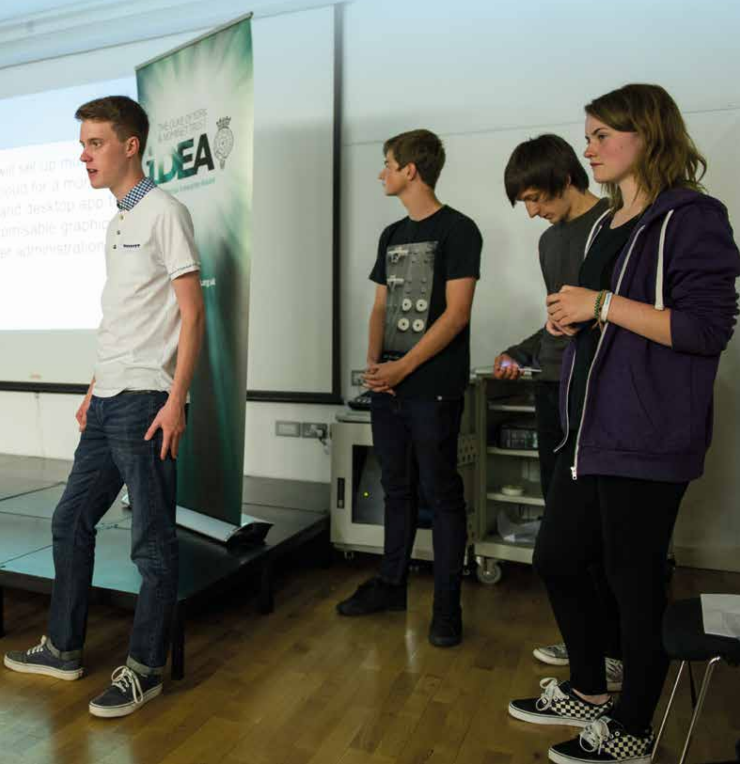
Young people present their digital enterprise project idea to a special Key Panel.